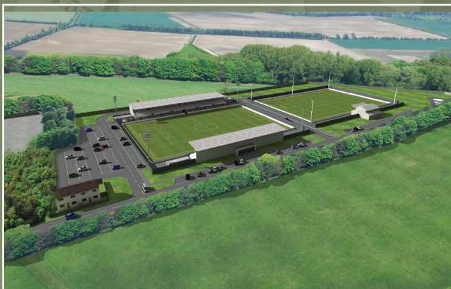
Cambridge City Football Club (CCFC) Proposed New Stadium, Sawston